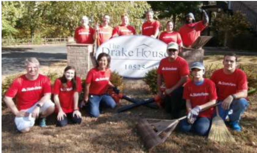
State Farm Digital's volunteer work group helped to spruce up the grounds by pruning, watering, raking and blowing leaves, cleaning garden benches and even organized the garden shed!