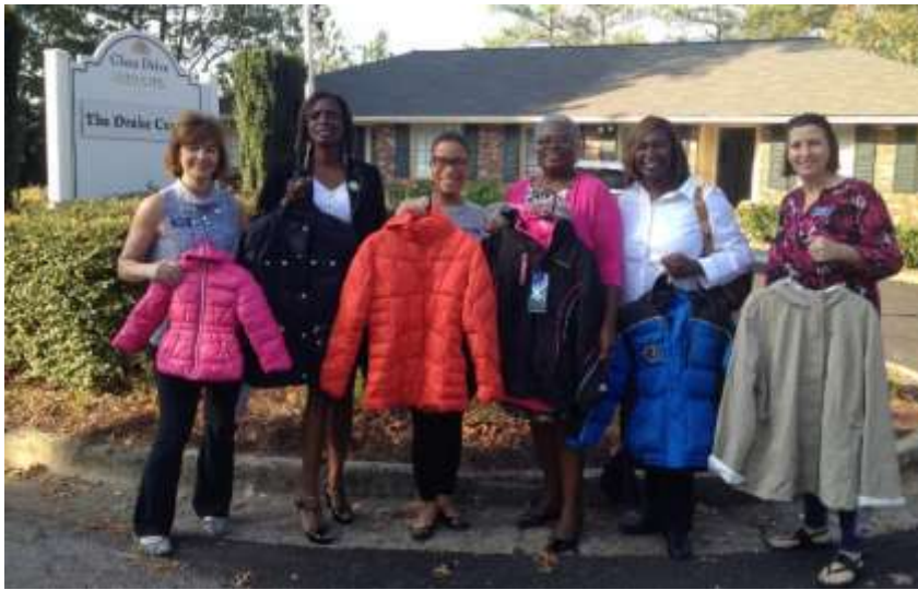
A coat drive sponsored by Alpha Kappa Alpha Sorority, Inc. of Phi Phi Omega Chapter produced over 40 warm coats of all sizes for our families.