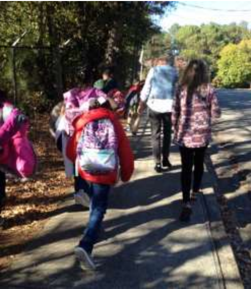
Drake House children looking forward to their first day in the after school program

The Drake Center is hopping with activities and children as we kicked off our new after school program on Nov 7th. We are pleased to add 2 new staff members to operate the program, which will allow children to ride the school bus home every day after school. We will also be providing all day care on the non-holiday school closings, such as election day. Two Fulton County School District teachers will be providing tutoring for the students, and volunteers will be sharing their indoor and outdoor hobbies and gifts with the children. Please contact Caroline Choe at cchoe@thedrakehouse.org , should you be interested in sharing in the fun.